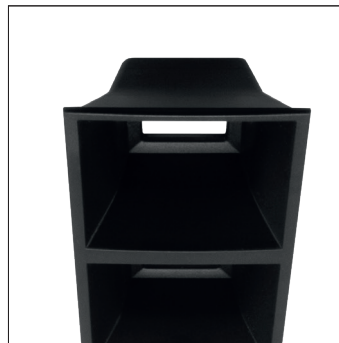
BM lens shade