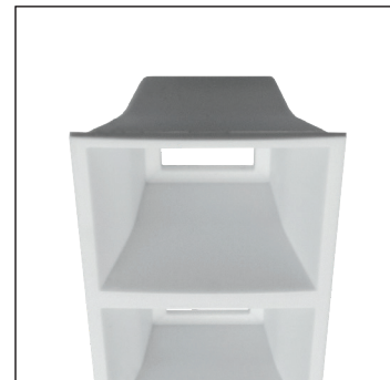
WM lens shade